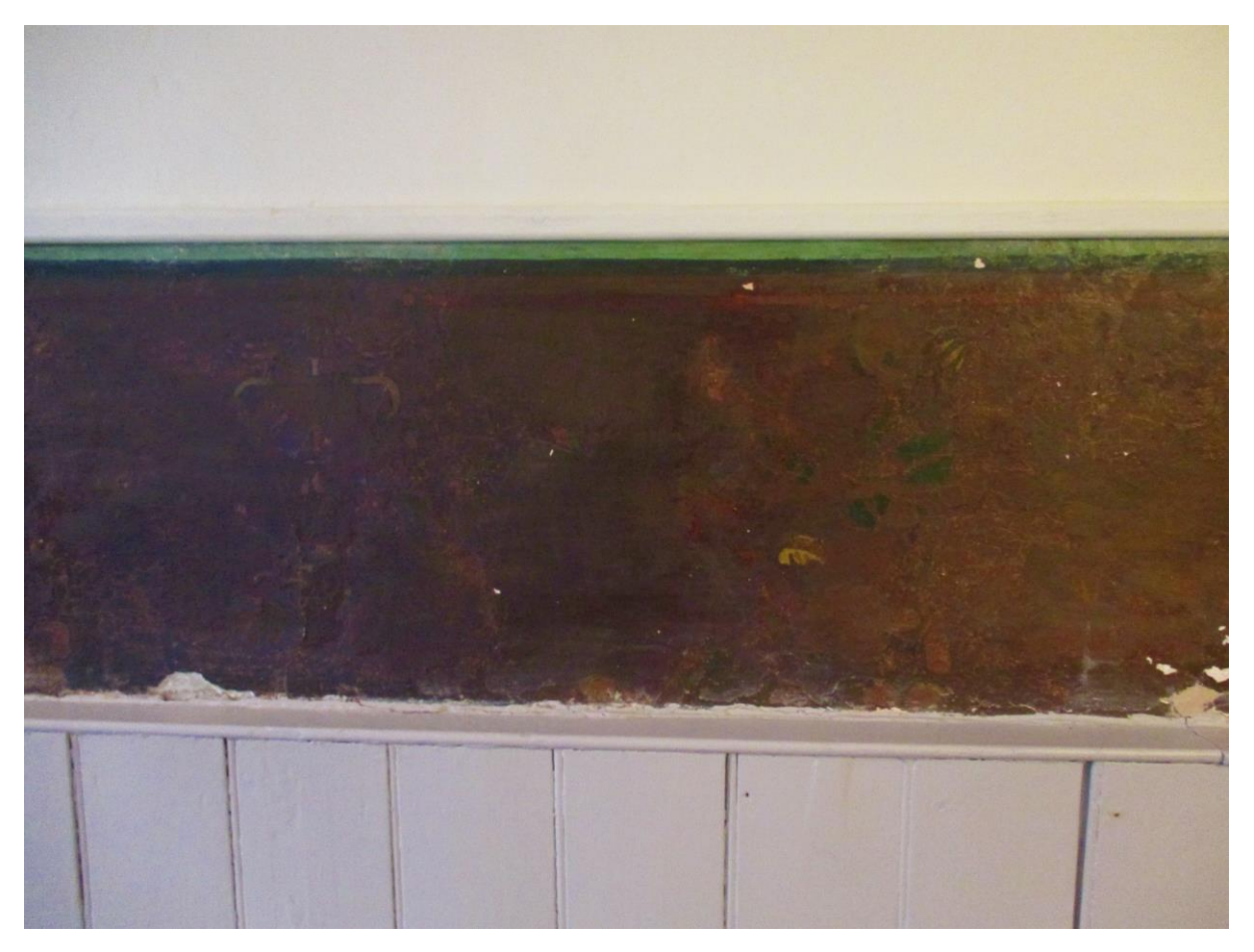
Figure 2: Remnants of Walter Crane's murals

The meeting room has tongue and groove panelling to the north and south walls, with a raised elders' stand to the west with fielded panelling. The east end of the meeting room has a former gallery with panelled front and the upper section of panelling opens by a vertical sliding mechanism. The room is lit by natural light from the west and south with pendant lighting.